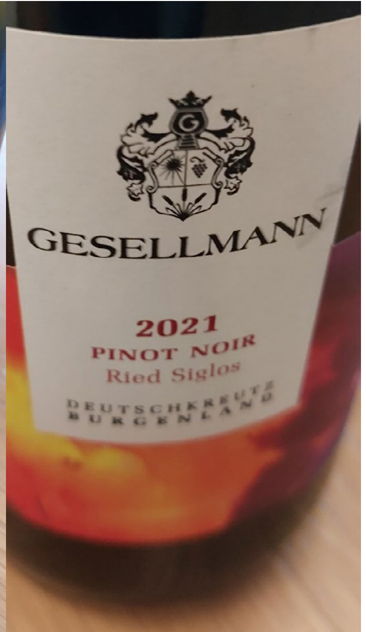
The Pinot Noir Ried Siglos 2021