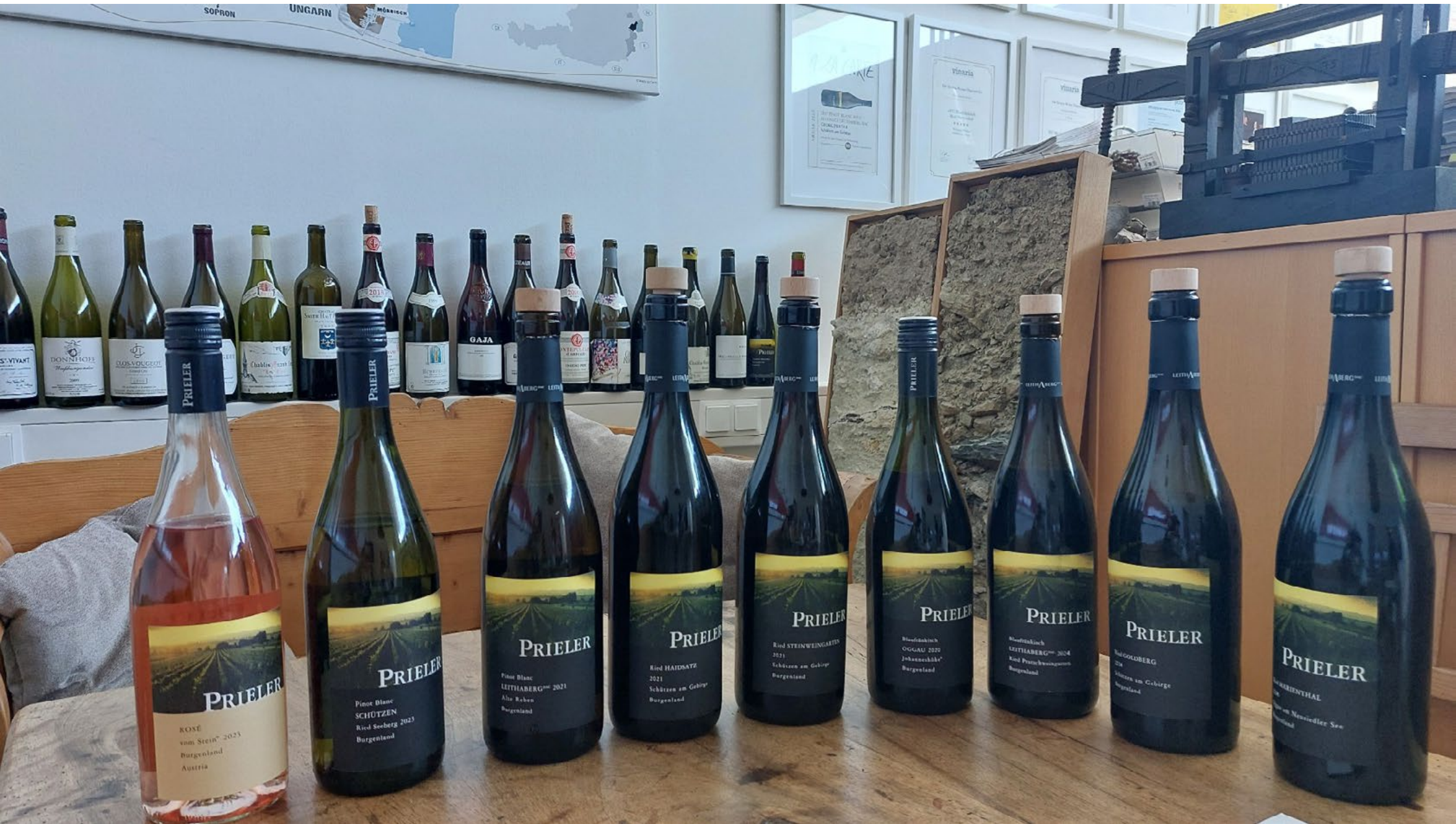
The selection for the tasting