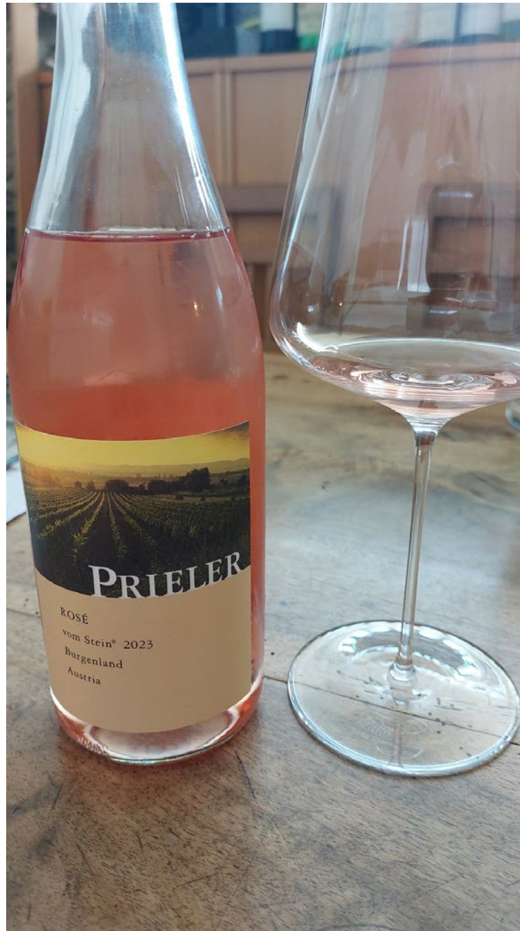
An elegant rosé to start

On the palate: creamy, fruity, juicy, spicy, white pepper, mineral