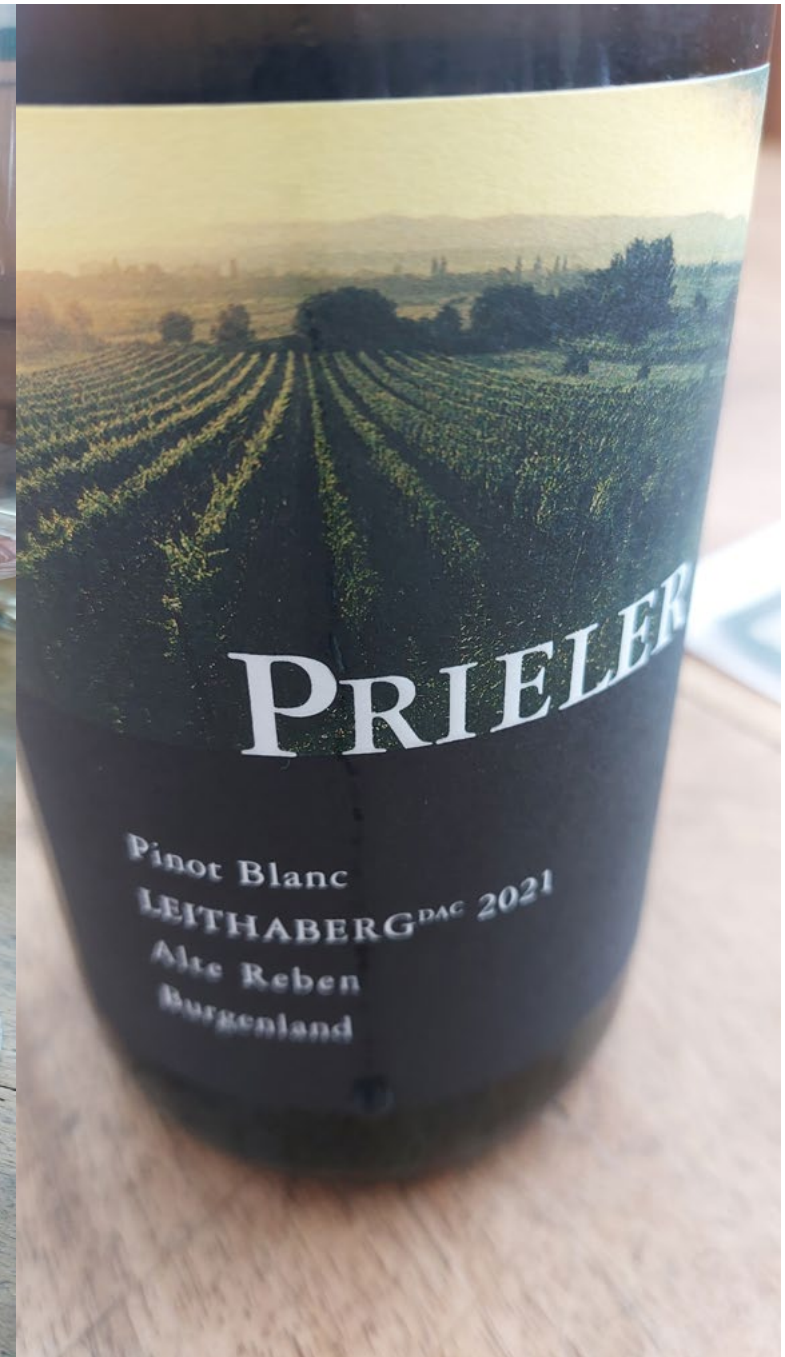
Pinot Blanc Leithaberg DAC 2021