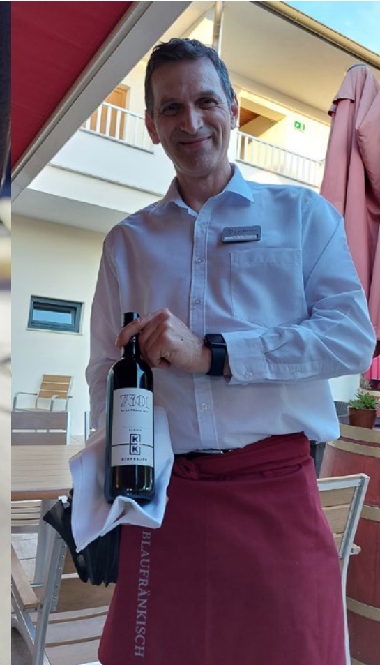
..during a dinner served at the restaurant 'Das Blaufränkisch'