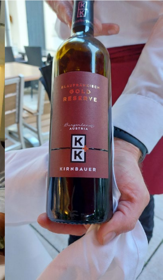
The Blaufränkisch Gold Reserve 2021