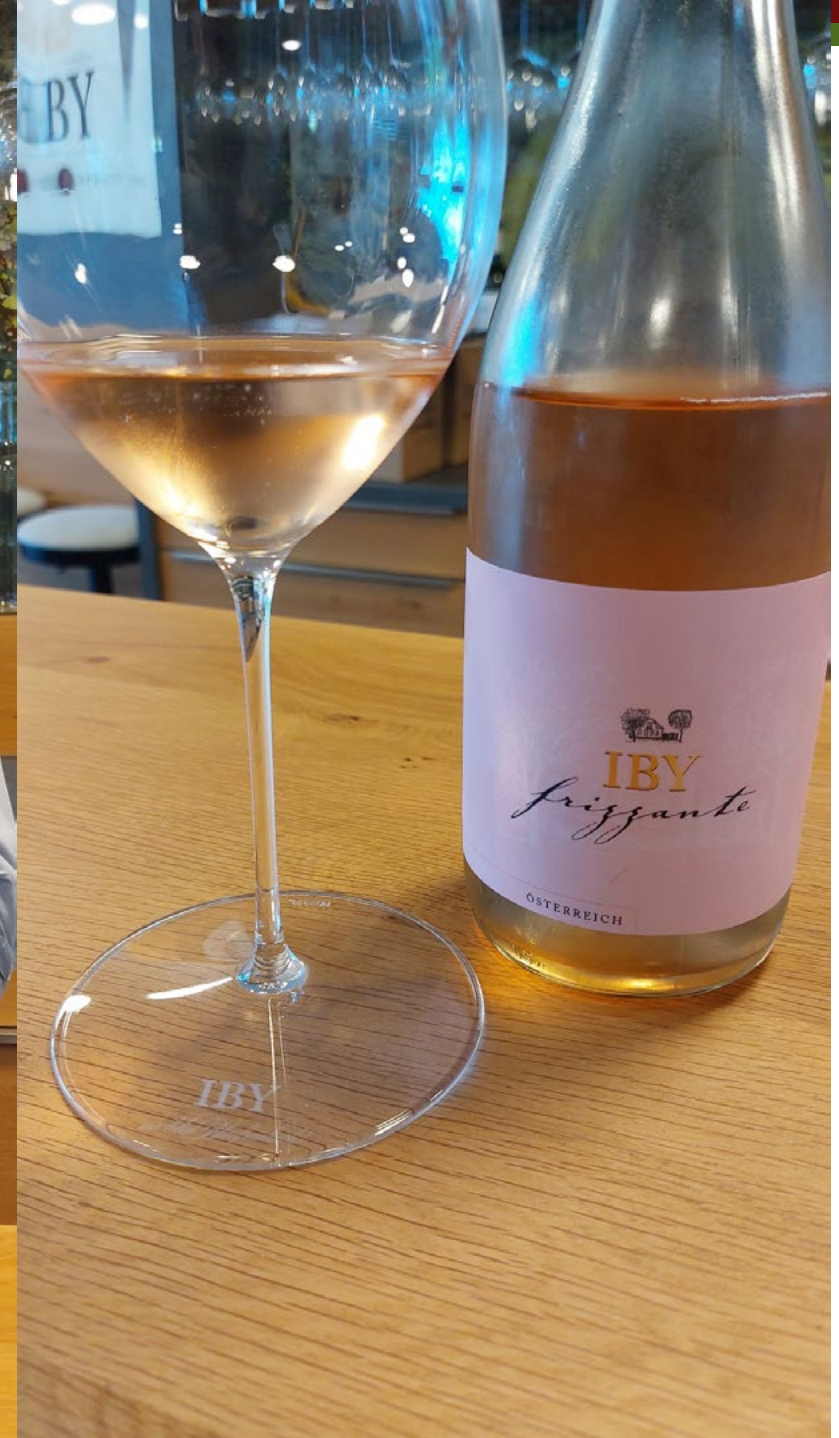
The Iby Frizzante