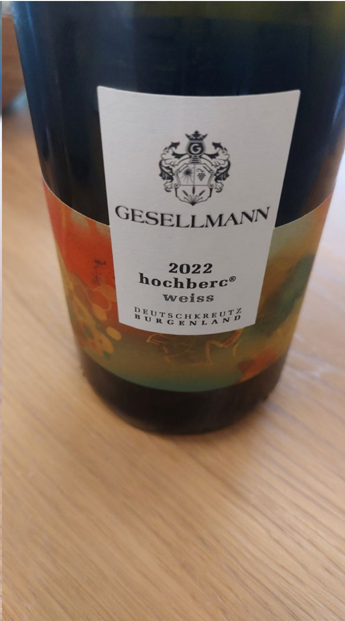
The field blend Hochberg 2022