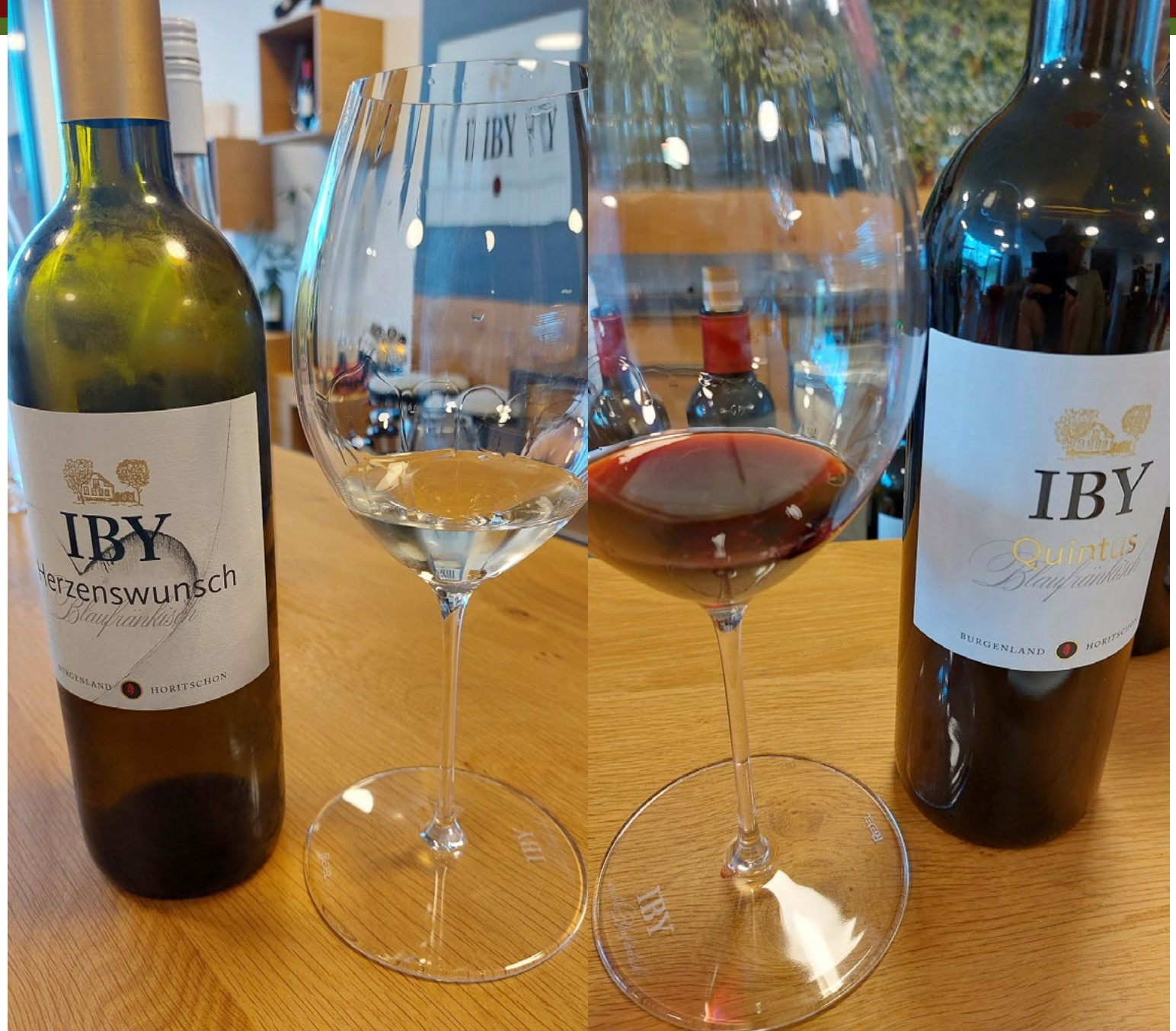
The Iby Herzenswunsch

Address: Weingut IBY, Am Blaufränkischweg 3, A-7312 Horitschon / Austria