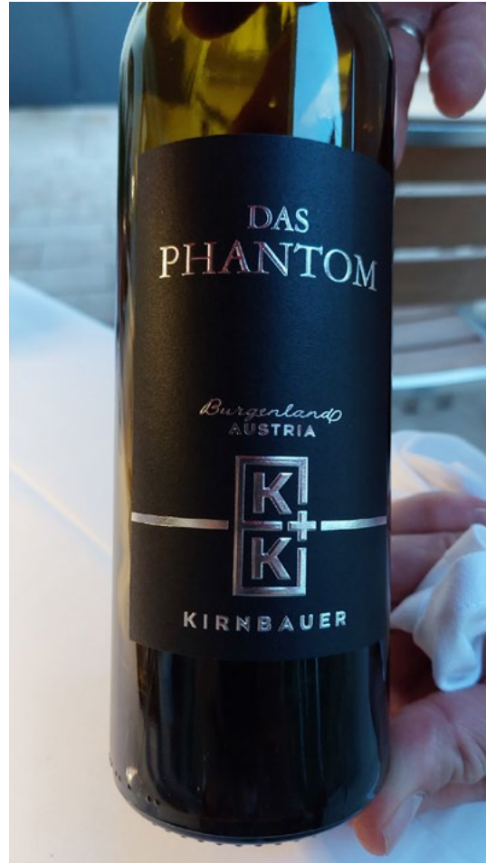
The Phantom 2021

Address: K+K Kirnbauer, Rotweinweg 1, 7301 Deutschkreutz Austria