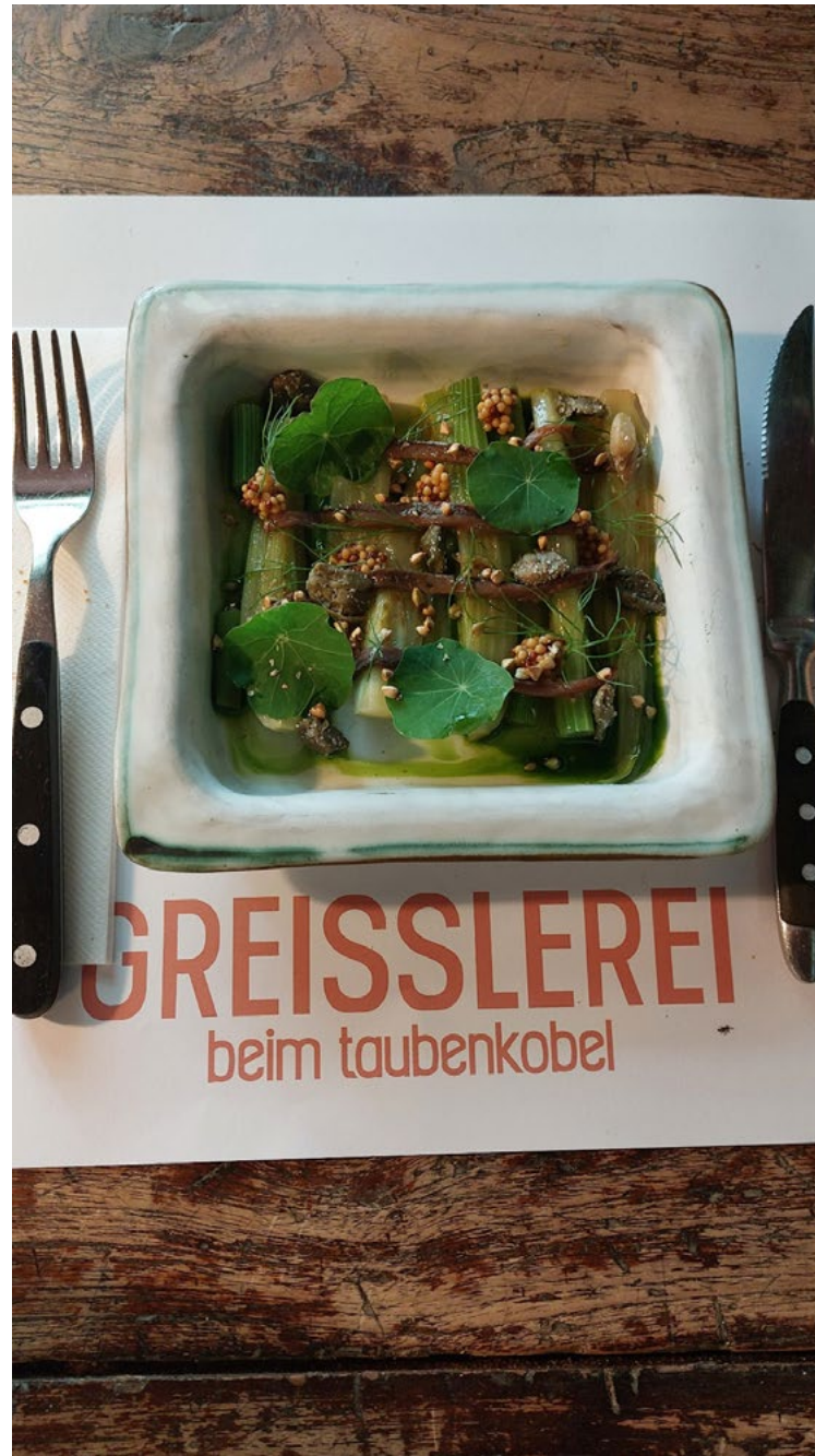
Lunch in the countryside

Address: Weingut PRIELER, Hauptstrasse 181, 7081 Schützen am Gebirge AUSTRIA