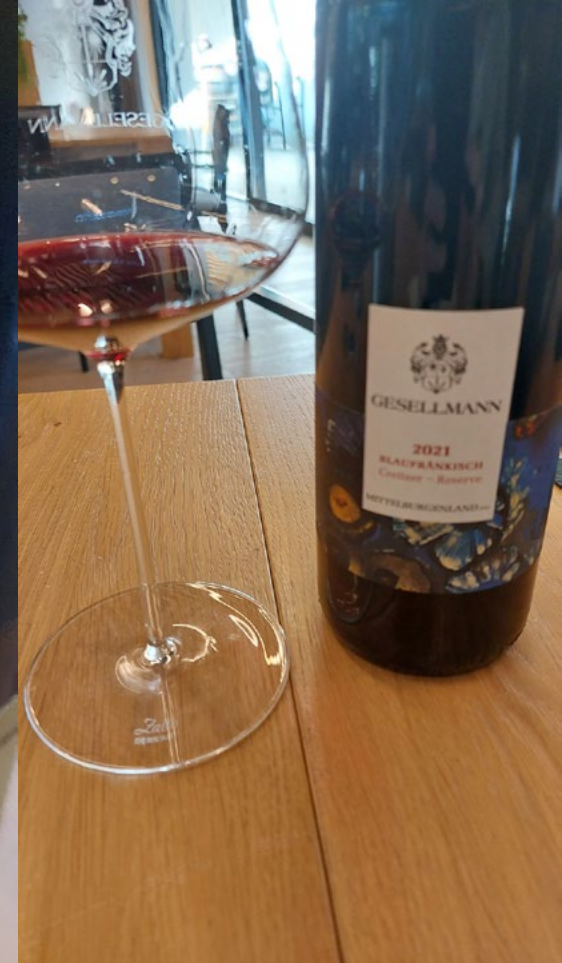
The Blaufränkisch Reserve 2021