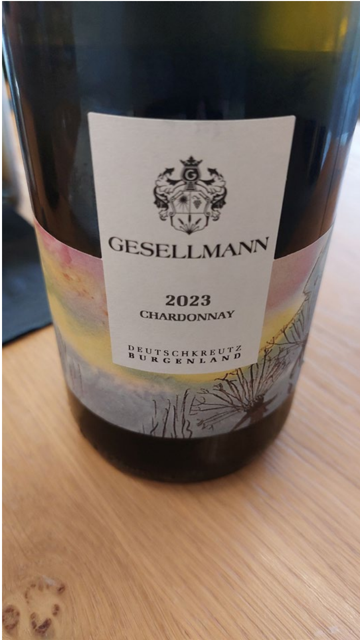
The Chardonnay 2023