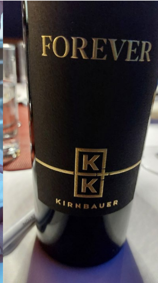
The Forever 2019