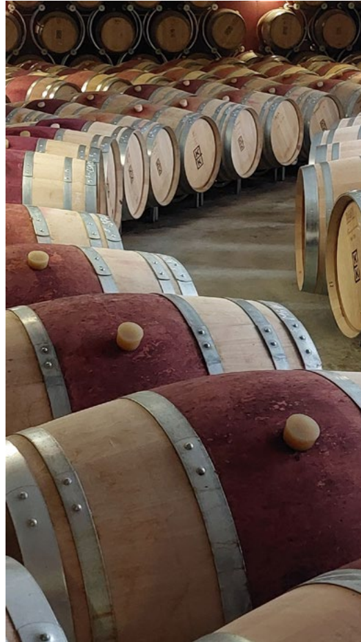
The K+K barrel cellar

The starter, a well seasoned tartar of salmon, with avocado cream and spicy paprika, is served with the juicy fresh 'Blaufränkisch 7301' 2021, from different vineyards, aged 14 months in barrique and with the complex 'Blaufränkisch Gold Reserve 2021', with a bouquet of black berries and hints of dark chocolate, cassis and with a pleasant freshness on the palate.