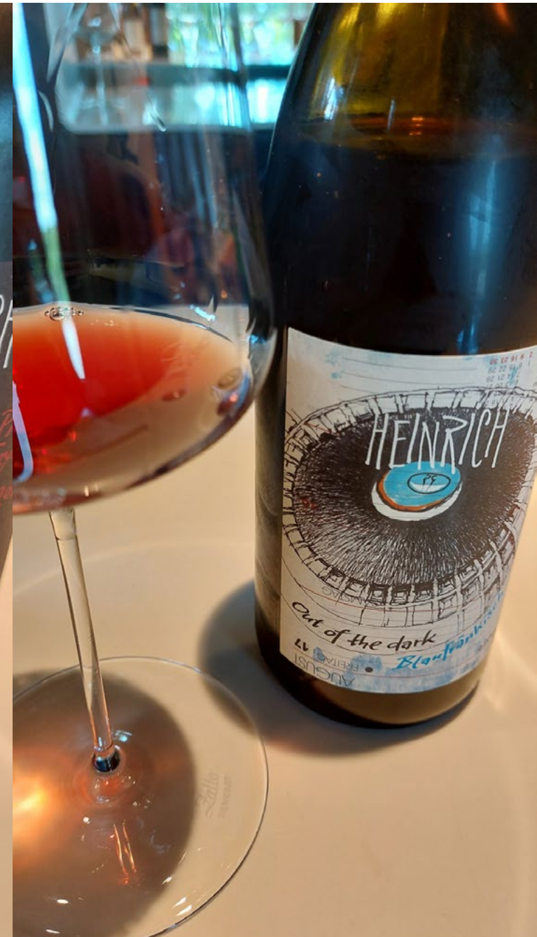
Out of the dark 2022 Blaufränkisch