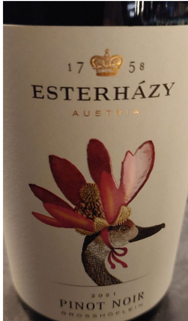
Elegant Pinot Noir 2021

ADDRESS: Esterházy Winery, Trausdorf, 7061 Trausdorf an der Wulka/Austria