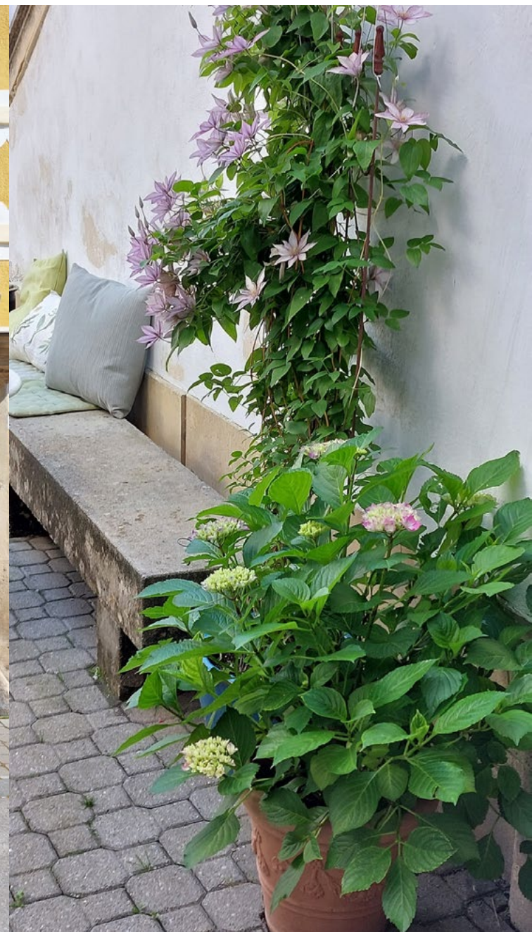
with a lovely courtyard