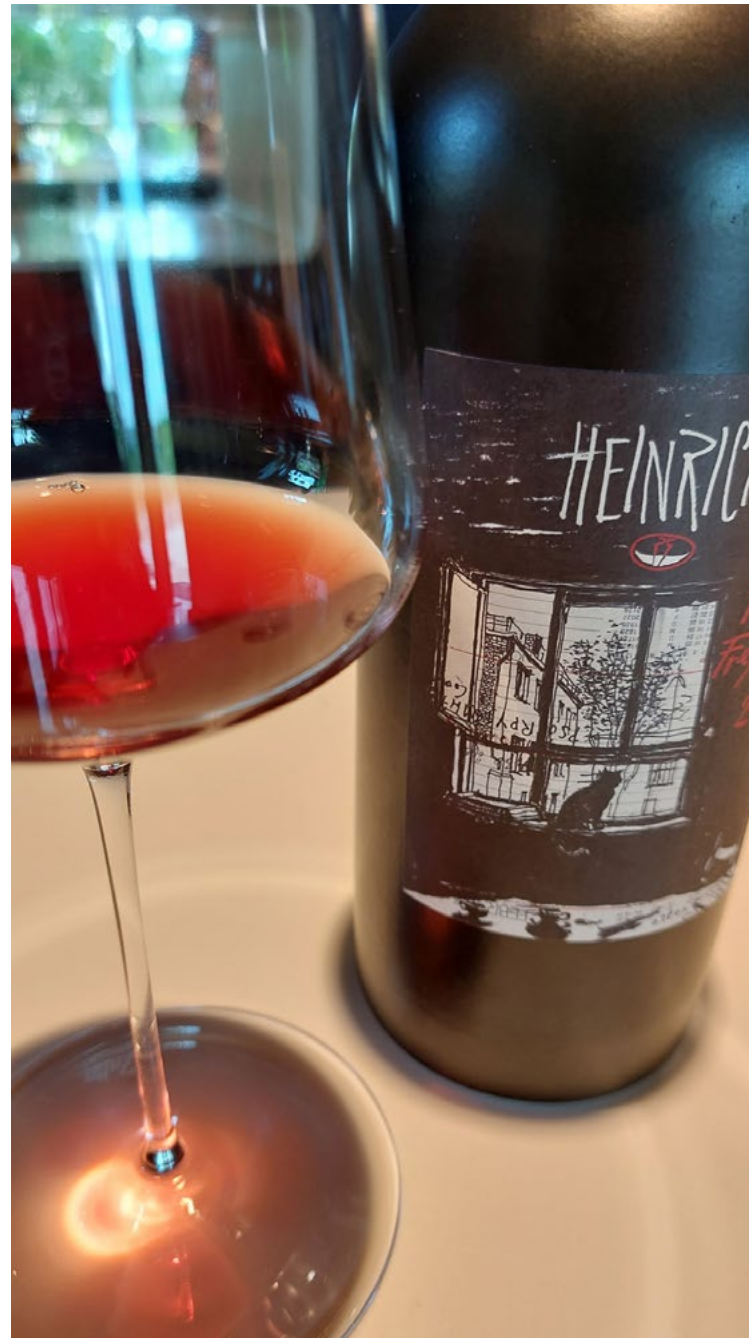
Pinot Noir Freyheit 2022

ADDRESS: Heinrich Gernot, Baumgarten, 60 7122 Gols /Austria