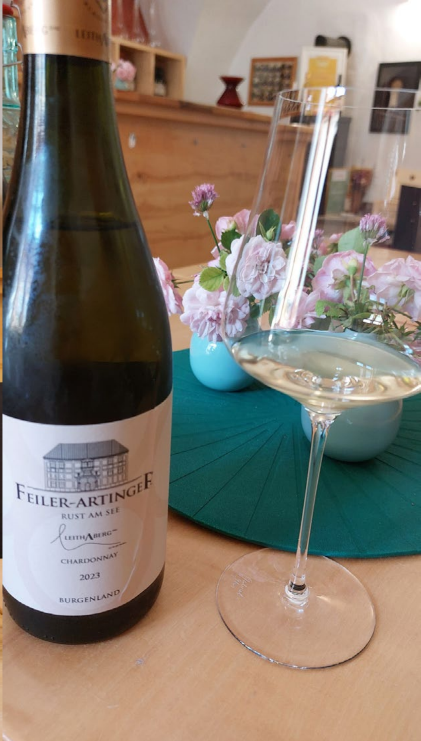
The Chardonnay Leithaberg 2023