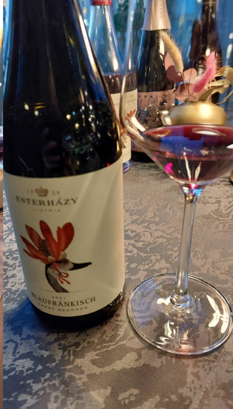
Complex Blaufränkisch St Georgen 2021