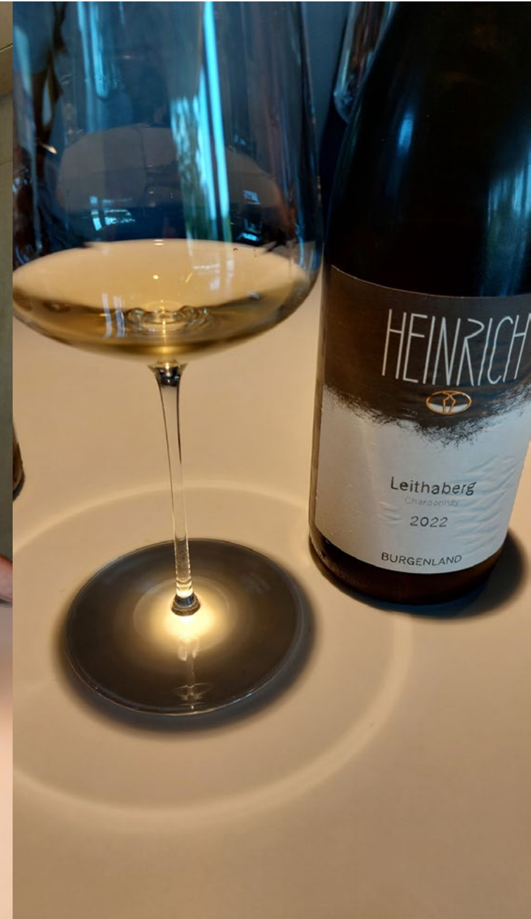
Leithaberg Chardonnay 2022