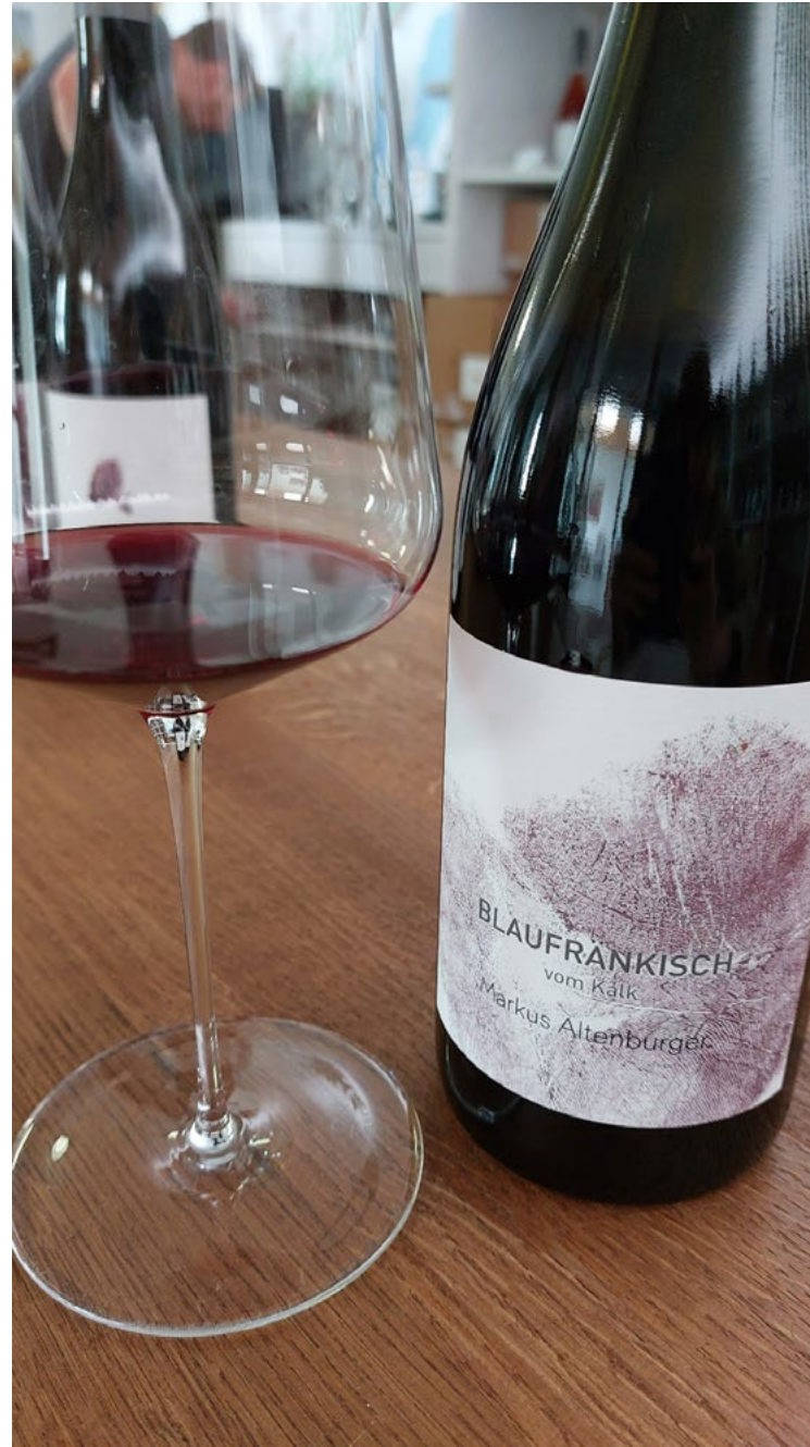
Blaufränkisch vom Kalk 2023

ADDRESS: Winery Markus Altenburger, Untere Hauptstrasse, 62 7093 Jois/Burgenland Austria