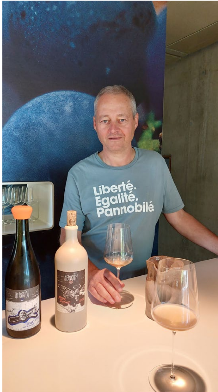
The tasting of ...

On the palate: red berries, good harmony, elegant