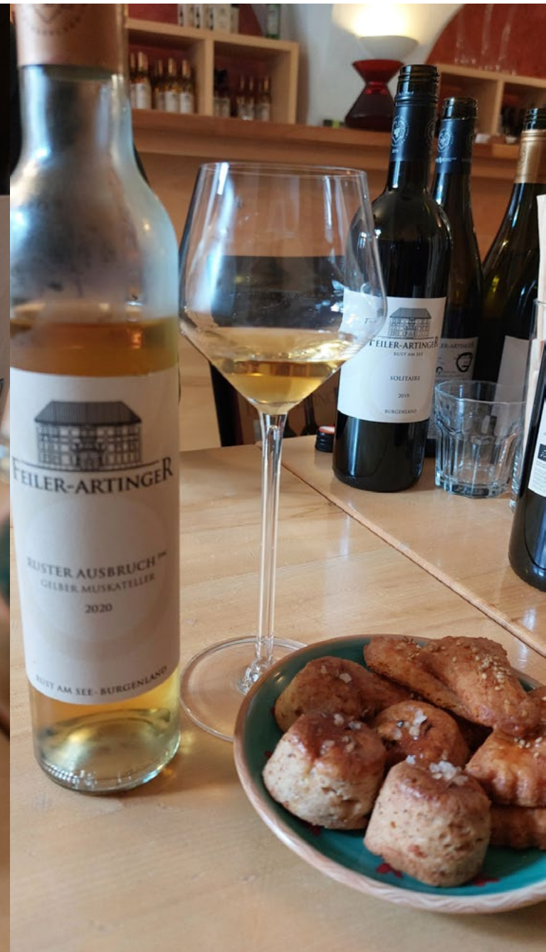
The delicious sweet Ruster Ausbruch 2020