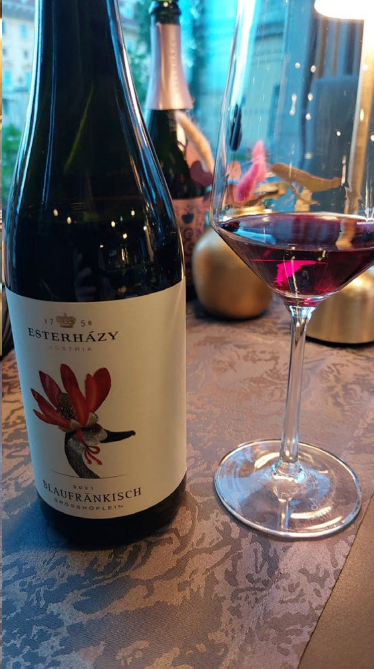
Juicy Blaufränkisch Grosshöflein 2021