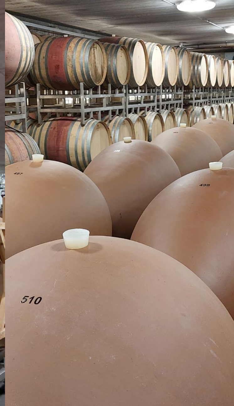
Impressive clay eggs in the cellar