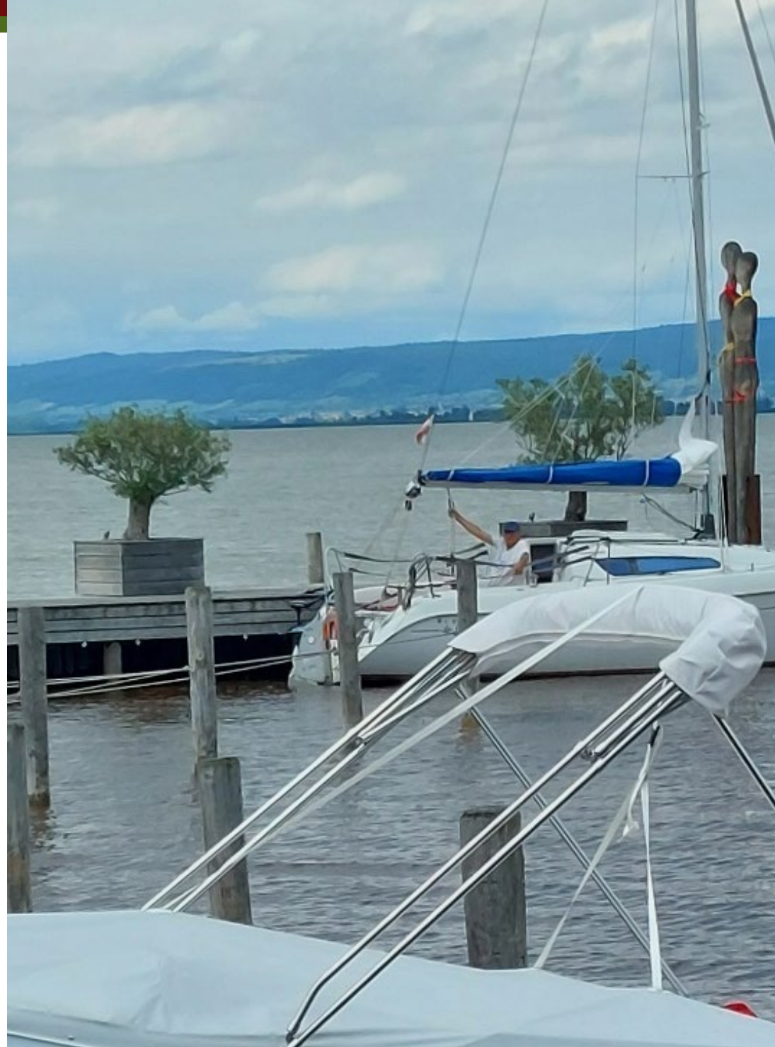
with a great view on the lake

ADDRESS: Winery Martin Pasler, Obere Hauptstrasse 44, 7093 Jois /Austria