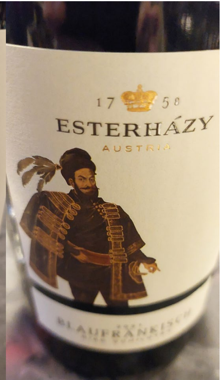
Top line Blaufränkisch Ried Schildten 2021