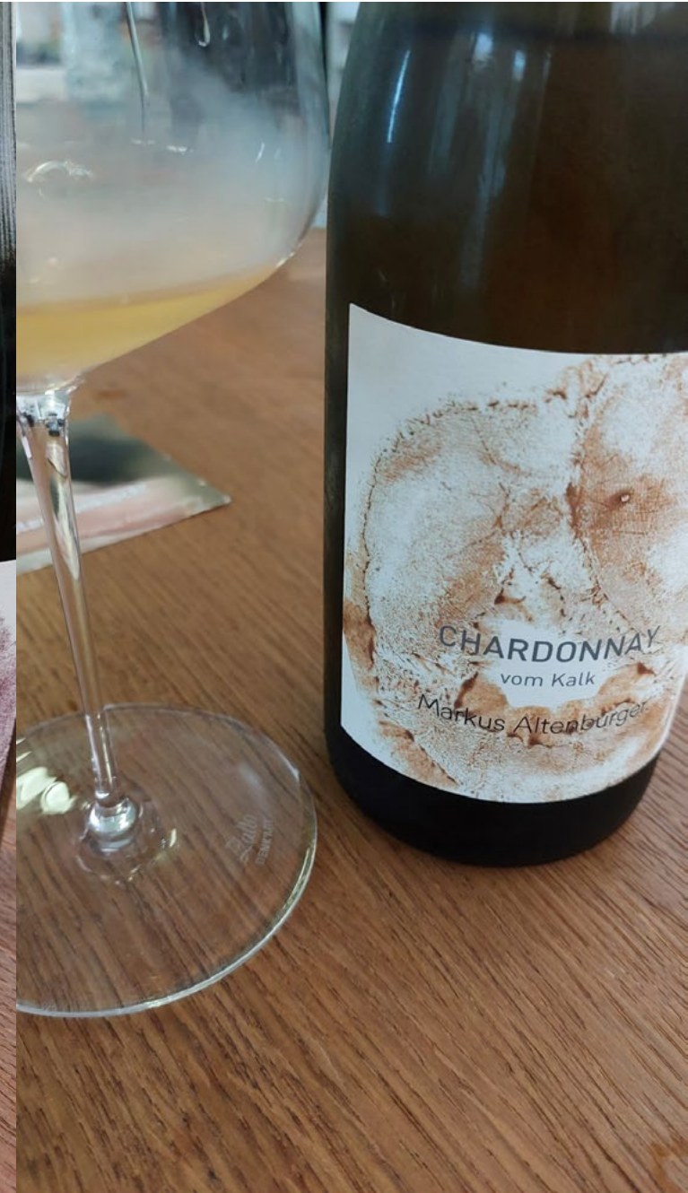
Chardonnay Vom Kalk 2023