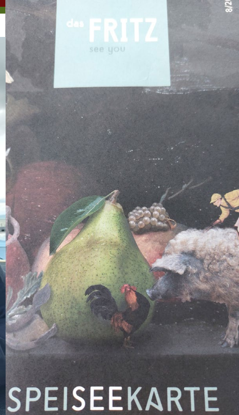
during lunch at 'The Fritz' Neusiedlersee