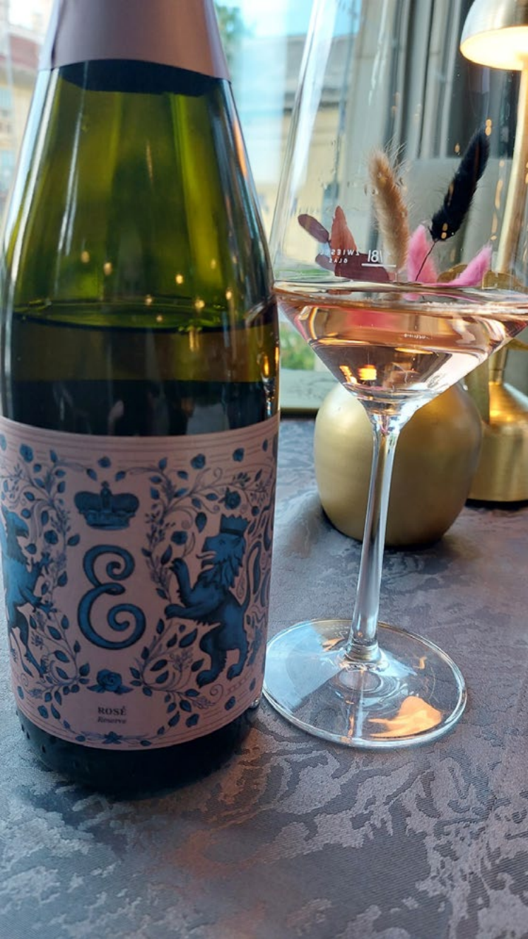
The Esterhazy sparkling Rosé Reserve