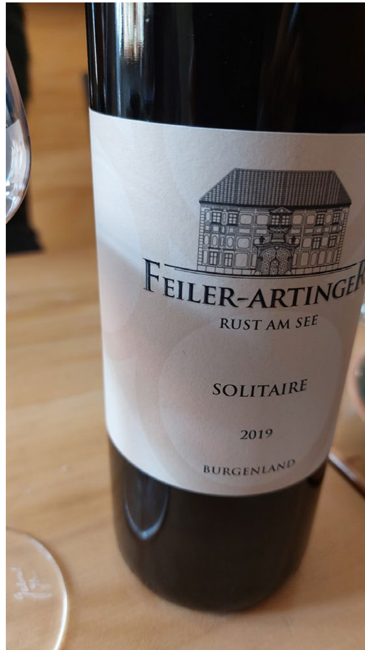
The Solitaire 2019

ADDRESS: WINERY Feiler – Artinger, Hauptstrasse 3 7071 RUST /Austria