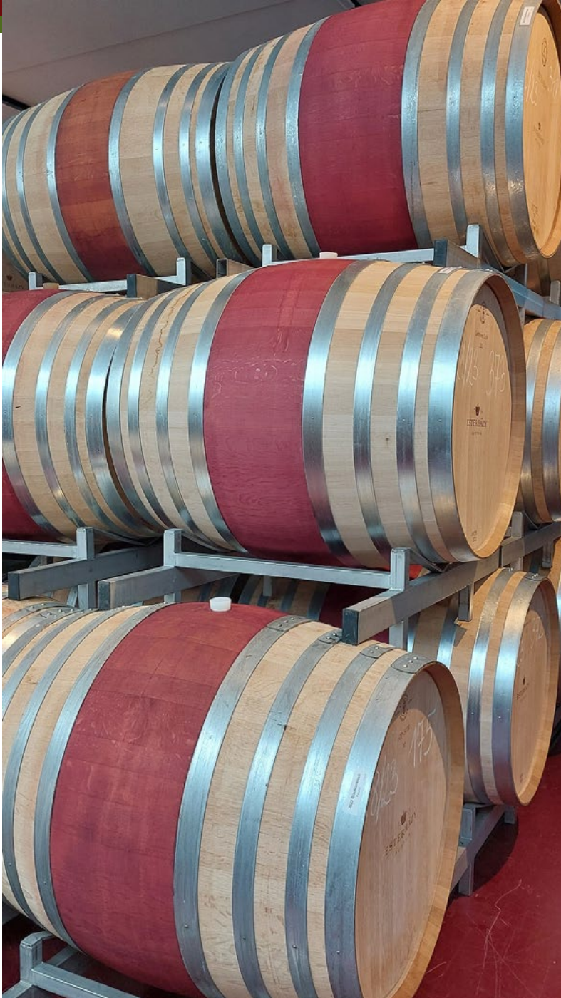
The barrel cellar